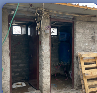
Improvements of latrine and shower (before and after) which includes constructing handrails, shower and shower seats, as well as accessible latrine, increase the safety of persons with disabilities and elderly.

Kobani Primary Mixed School in Gawilan refugee camp, Duhok, KRI