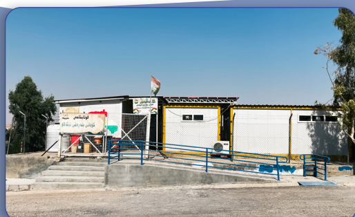
Accessibility upgrade of public facility for persons with disabilities and elderly.

Women worker receiving Cash for Work, as she was involved in work for her shelter improvement. She is to become a contributor to her family livelihoods through CfW.