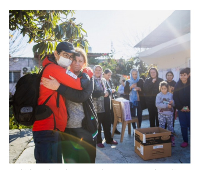
Turkish earthquake survivor hugs Peace Winds staff member

You can also stay up-to-date on relief efforts in Türkiye and around the world by following Peace Winds on Twitter, Facebook, Instagram, and LinkedIn or by subscribing to our newsletter at peacewindsamerica.org. Thank you for supporting Peace Winds and the people of Türkiye and Syria in this time of great need.