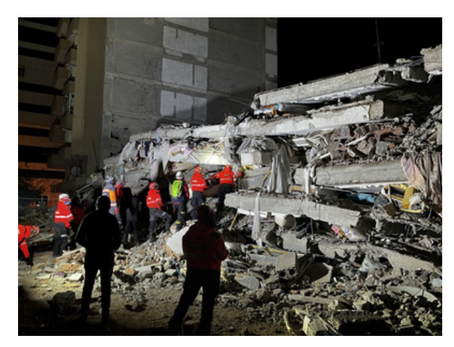
Peace Winds staff members work alongside local partners to perform search-and-rescue operations

Immediately following the disaster, Peace Winds dispatched our flying search-and-rescue medical team, ARROWS, and staff members are currently on the ground in Türkiye providing assistance. Peace Winds partnered with GEA, a volunteer search-and-rescue, ecology, and humanitarian aid group present in Türkiye. In the early days after the earthquakes, ARROWS and GEA team members worked together to rescue 30 survivors from the rubble.