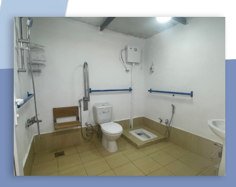
Photo of latrines and shower upgrade (before and after) which included constructing handrails, shower seats, accessible latrine and shower. These improvements are increasing the safety of persons with disabilities and elderly.