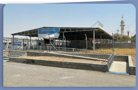
Upgraded public facility for persons with disabilities and elderly.

In order to explain the steps and requirements of the improvements, Peace Winds conducted orientations for the selected shelter families, followed by an agreement for each shelter detailing the materials and the amount they would receive, as well as the amount of cash they will receive for their work.