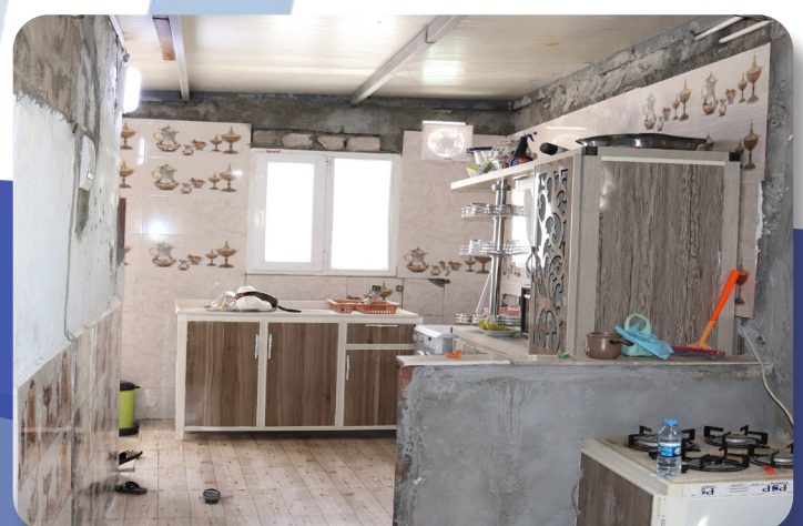
Photos of kitchen upgrade (before and after) for a vulnerable family of 6 members in Domiz 1 refugee camp, Duhok, KRI