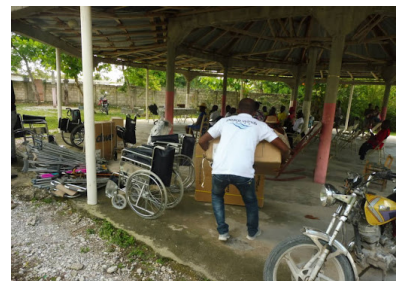
Unloading supplies for distribution