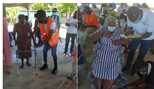
Handing out mobility aids and confirming beneficiaries know how to use them correctly