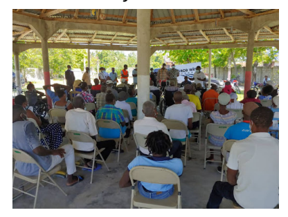
Explaining the distribution process to the beneficiaries